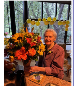
Tot, 97 years young!

Well, since you asked, Whiskey is a diet drink, anti-oxidant. Whiskey may help prevent cancer. Whiskey may lower the risk of heart disease. Drinking 1–6 glasses of whiskey per week can lower risk of dementia. Whiskey can relieve stress. Whiskey can prevent the risk of stroke!