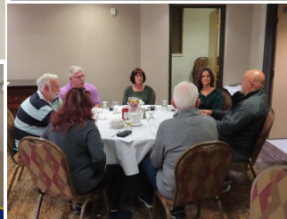
Board Meeting after

So weekly from an email list of 360 people, about 20 on average meet around downtown and talk Downtown. Putting a positive